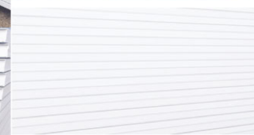
SANDWICH PANEL EUROLINE