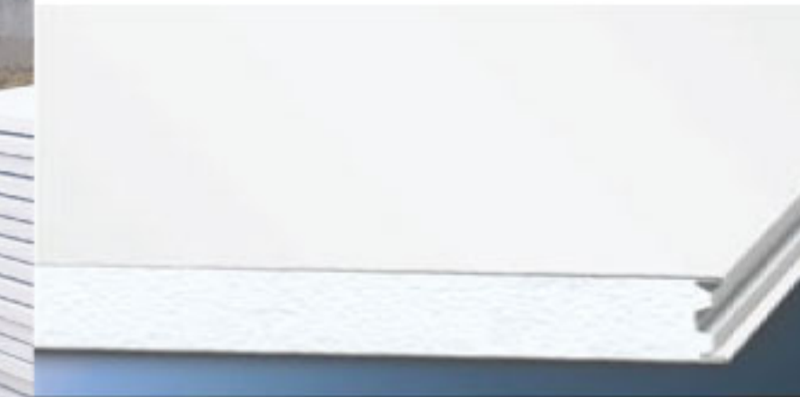
SANDWICH PANEL SMOOTH