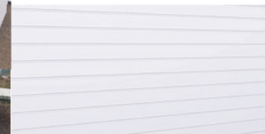
SANDWICH PANEL MICRORIB